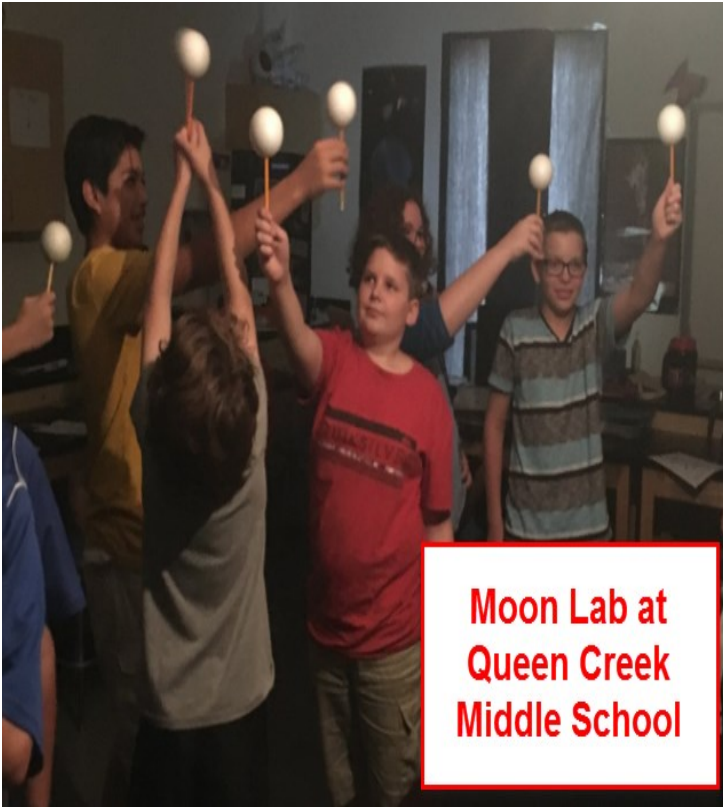
Moon Lab at Queen Creek Middle School