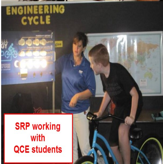
SRP working with QCE students