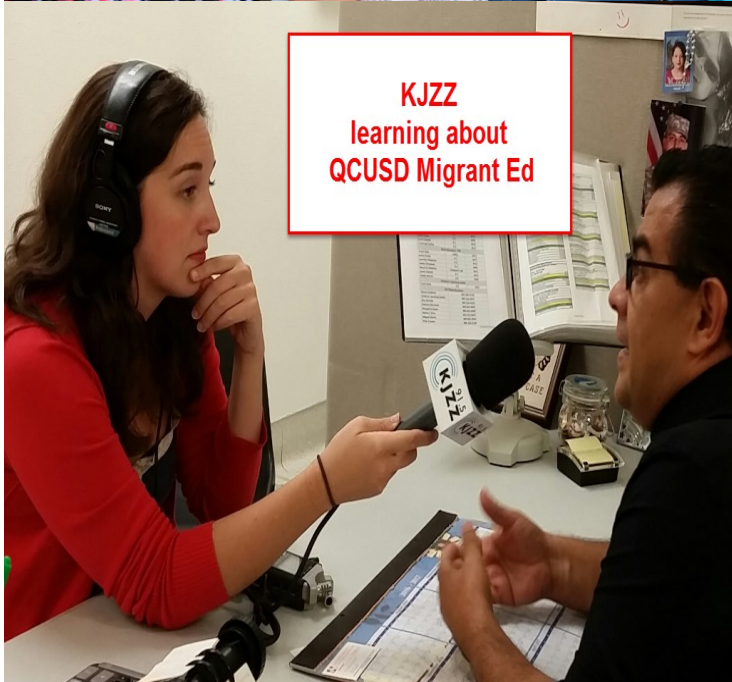
KJZZ learning about QCUSD Migrant Ed