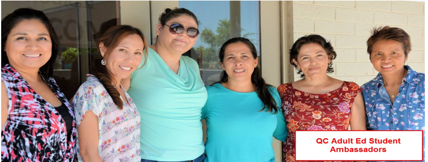
QC Adult Ed Student Ambassadors