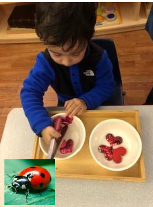
Transferring using tongs