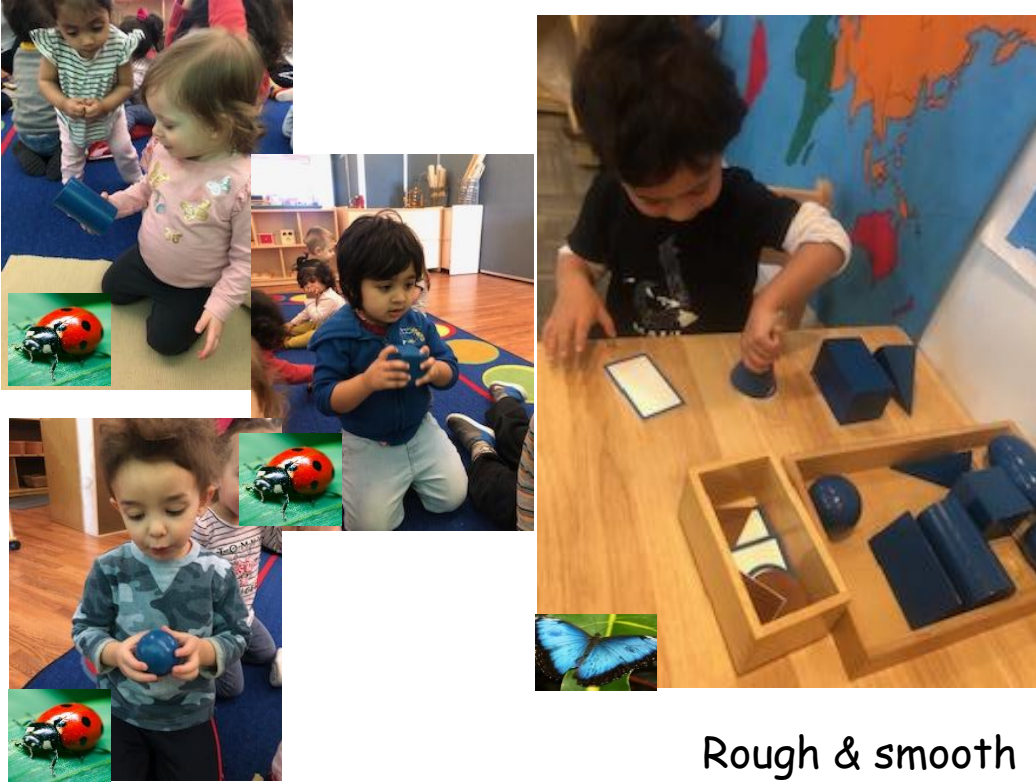
Color Box 1 / Color Box 2

Order, concentration, coordination, and independence.