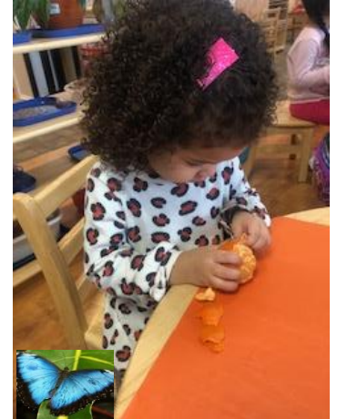
Peeling a clementine