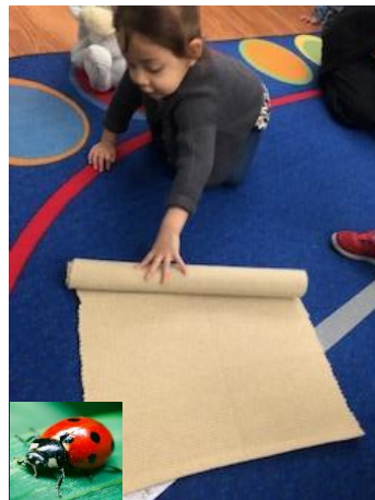
Rolling a rug