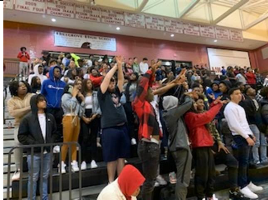
Students at game vs Marietta.

Student Section- Our students came out supported the teams this week!