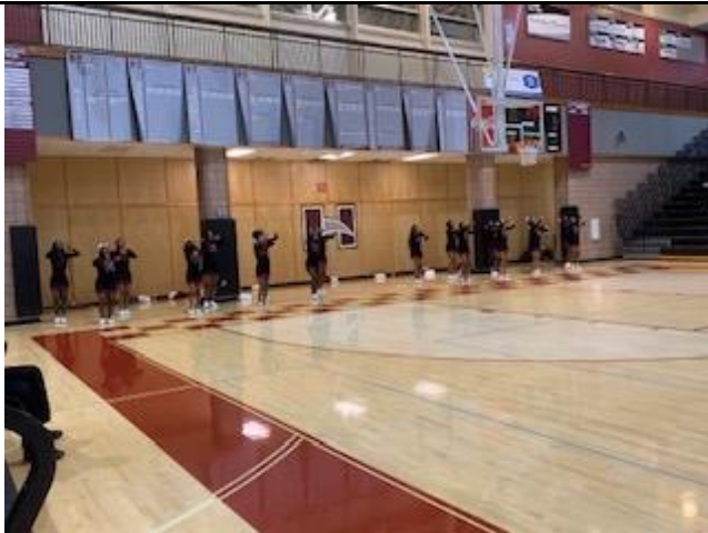
Varsity cheerleaders during North Cobb games.

Basketball Cheerleaders- They are always there to support the teams!