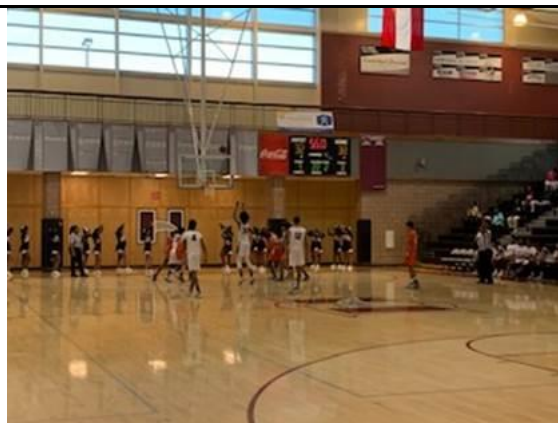
JV Boys North Cobb