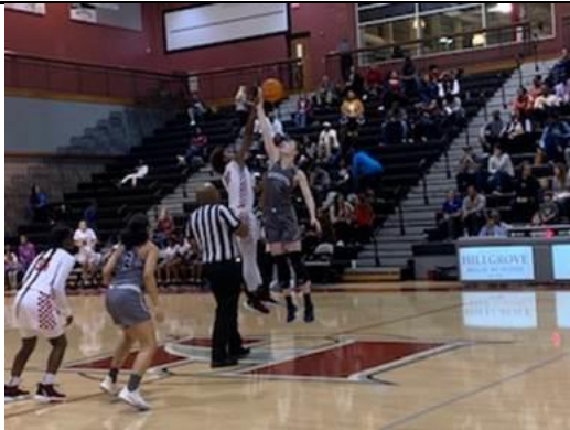
Tip Off vs Marietta

Varsity Girls Basketball- lost to North Cobb 61-41 and lost to Marietta.