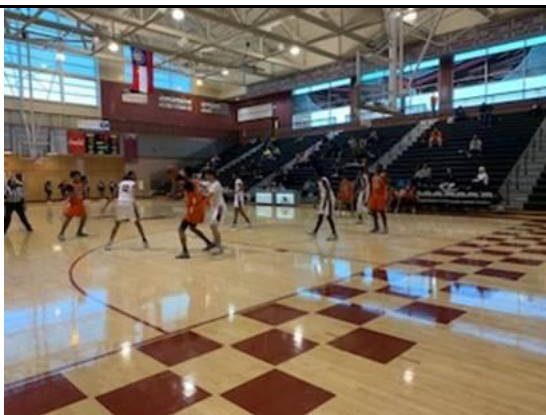
JV Boys vs North Cobb

JV Boys Basketball- beat North Cobb 43-32 and beat Marietta 47-39