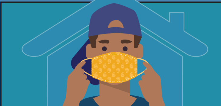
TAKE OFF YOUR FACE COVERING