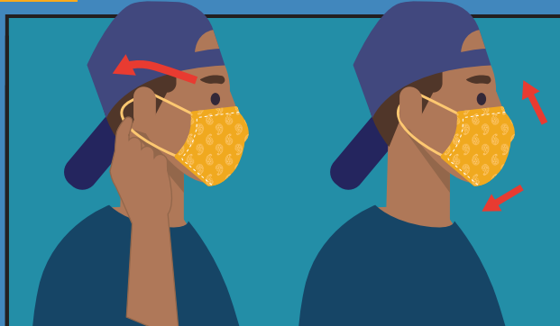
PLACE OVER NOSE AND MOUTH