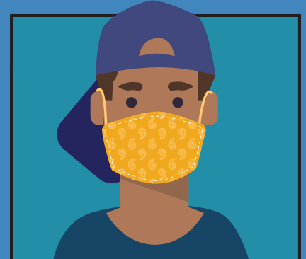
MAKE SURE YOU CAN BREATHE EASILY