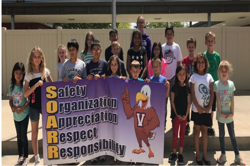
Valencia students SOARR