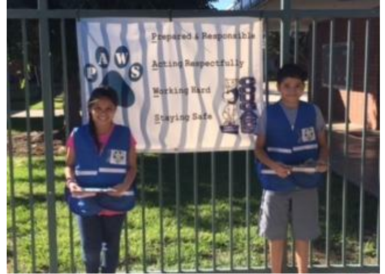
Cabrillo student show PAWS