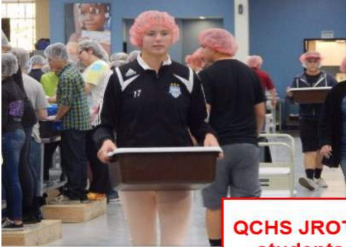
QCHS JROTC students volunteer at Feed My Starving Children