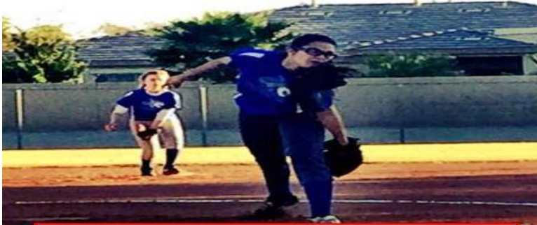
QCMS softball team makes the playoffs!